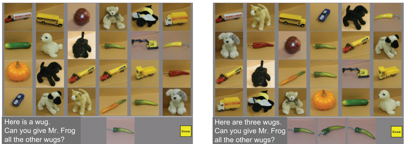
Fig. 2. Examples of the experimental display when a single exemplar was presented (left) and when three subordinate-level exemplars were presented (right). Exemplars were presented in the lower portion of the screen and described by a nonsense word (e.g., “wug”). Participants were instructed to select objects similar to the exemplar from the 24-item generalization set shown above. They clicked the “Done” button after they selected the matches on each trial. The selected items were highlighted by a green box (not shown).

Although we included all conditions in each experiment to fully replicate Xu and Tenenbaum’s (2007b) experiment, we focused our analyses on changes in basic-level responding in the one-exemplar and three-subordinate-level-exemplars conditions (see results for Experiments 1–3). Analyses of data from the remaining conditions in the full data set (including two supplemental experiments) revealed no significant differences in responding across experiments (see Table 1 for the full set of results). In particular, as in Xu and Tenenbaum’s experiment, participants generalized to a high percentage of the subordinate-level matches across all exemplar conditions and experiments. An analysis of variance (ANOVA) comparing